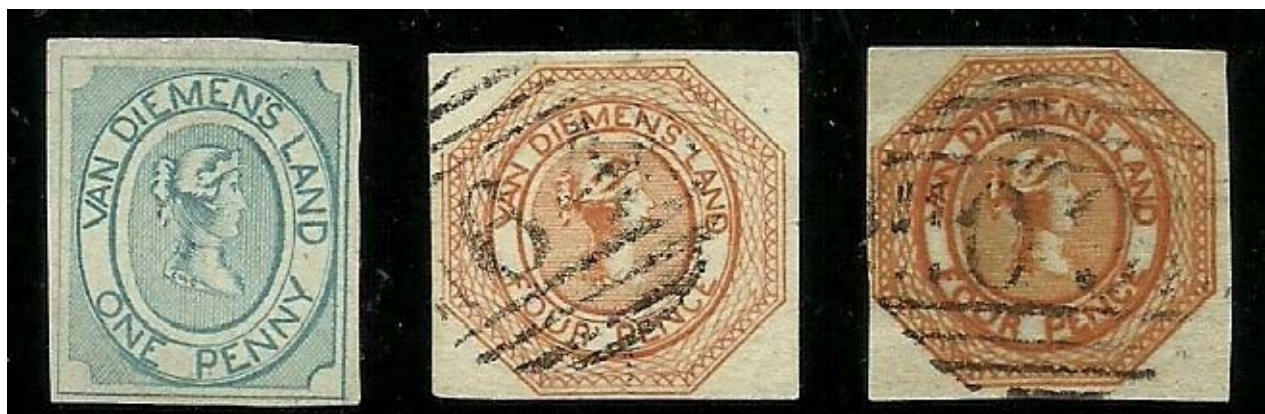
Figure 1: Tasmania Sc#1 (left), 2 (center), 2b (right) [All at 150%]

Twenty-four images of each stamp were individually engraved directly on a copper plate. Because of the softness of the metal and the wear, the early impressions are clear and the later ones blurred. A simple design was adopted showing a right profile of the young Queen Victoria. It is set in an oval with a rectangular frame for the one penny and in a circle with an octagonal frame for the four pence. The initials of the engraver (CWC) can be seen at the base of the neck.